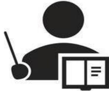
Classes by Experts & Experienced Staff