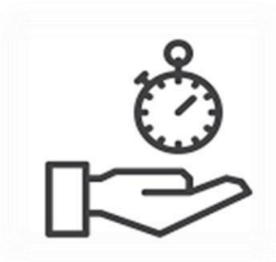
Short Cuts in Time