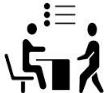
Conducting Test Session