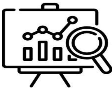
Analysis Your Improving Level